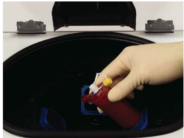
Fig. 3 GPS III system and centrifuge

Various blood separation devices have differing preparation steps essentially accomplishing similar goals. The Biomet Biologics GPS III system is described here for simplicity. About 30–60 ml of venous blood is drawn with