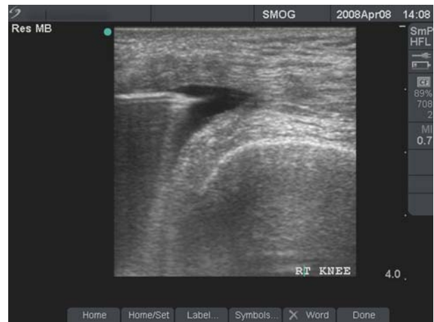
Fig. 7 Ultrasound guided suprapatella bursa injection/graft

Barett et al. enrolled nine patients in a pilot study to evaluate PRP injections with plantar fasciitis. Patients met the criteria if they were willing to avoid conservative treatments including bracing, NSAIDS, and avoidance of a cortisone injection for 90 days prior. All patients demonstrated hypoechoic and thickened plantar fascia on ultrasound. While anesthetizing each patient with a block of the posterior tibial and sural nerve, 3 cc of autologous PRP was injected under ultrasound guidance (Fig. 7).