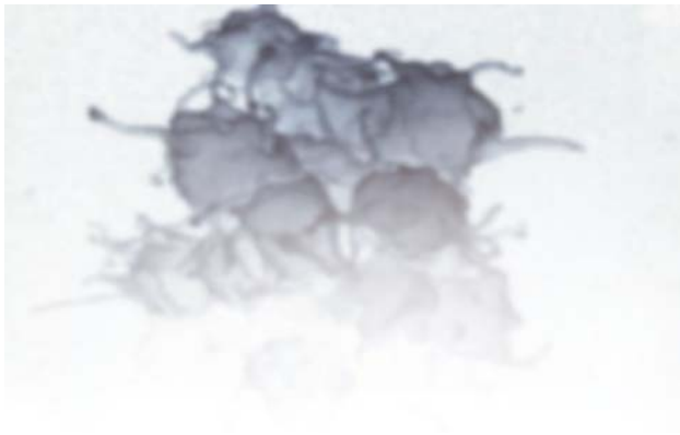
Fig. 2 Active platelets

TGFbeta is active during inflammation, and influences the regulation of cellular migration and proliferation; stimulate cell replication, and fibronectin binding interactions [23] (Fig. 2). VEGF is produced at its highest levels only after the inflammatory phase, and is a potent stimulator of angiogenesis. Anitua et al. showed that in vitro VEGF and Hepatocyte Growth Factor (HGF) considerably increased following exposure to the pool of released growth factors; suggesting they accelerate tendon cell proliferation and stimulate type I collagen synthesis [11]. PDGF is produced following tendon damage and helps stimulate the production of other growth factors and has roles in tissue remodeling. PDGF promotes mesenchymal stem cell replication, osteoid production, endothelial cell replication, and collagen synthesis. It is likely the first growth factor present in a wound and starts connective tissue healing by promoting collagen and protein synthesis [7]. However, a recent animal study by Ranly et al. suggests that PDGF may actually inhibit bone growth [24].