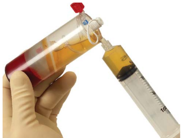
Fig. 4 GPS III system, withdrawing of platelet poor plasma to be discarded

aseptic technique from the antecubital vein. An 18 or 19 g butterfly needle is advised, in efforts of avoiding irritation and trauma to the platelets which are in a resting state. The blood is then placed in an FDA approved device and centrifuged for 15 min at 3,200 rpm (Fig. 3). Afterward, the blood is separated into platelet poor plasma (PPP), RBC, and PRP. Next the PPP is extracted through a special port and discarded from the device (Fig. 4). While the PRP is in a vacuumed space, the device is shaken for 30 s to re-suspend the platelets. Afterwards the PRP is withdrawn (Fig. 5). Depending on the initial blood draw, there is approximately 3 or 6 cc of PRP available.