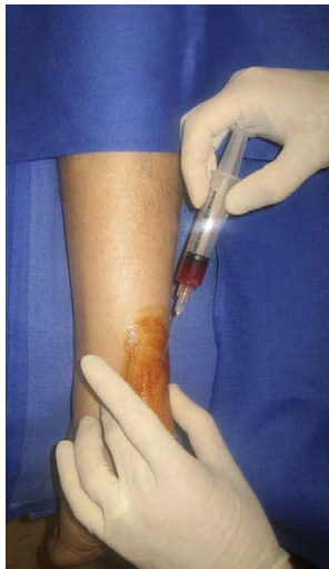
Fig. 3. PRP injection for chronic Achilles tendinopathy.

Muscle healing, like tendon healing, occurs in a series of overlapping phases, including inflammation, proliferation, and remodeling. These events are also