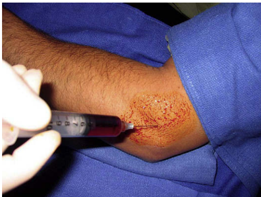
Fig. 2. Injection of PRP for chronic elbow tendinosis.

Anitua and colleagues 45 found faster recovery in athletes undergoing PRP-enhanced Achilles tendon repair. In their study, athletes treated with surgery and PRP were compared with a retrospective control group of athletes treated with surgery alone. The PRP patients recovered range of motion earlier, had no wound complications, and returned to training activities in less time than control patients. The cross-sectional area of the PRP-treated tendons was also smaller than that in nontreated tendons when measured by ultrasound. Randelli and colleagues 49 recently