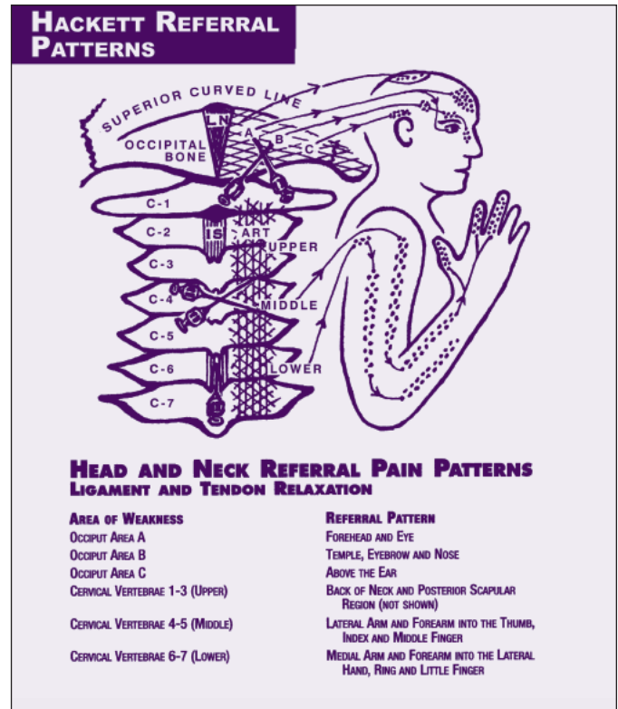
FIGURE 3. Head and neck referral pain patterns. From Hauser, "Prolo Your Pain Away," Second Edition. 2004. Beulah Land Press. Oak Park, IL. Used with permission.

Prolotherapy has been used to successfully treat a large variety of musculoskeletal syndromes, including cervical, thoracic and lumbar pain syndromes, patients diagnosed with "disc disease," mechanical low back pain, plantar fasciitis, foot or ankle pain, chronic rotator cuff or bicipital tendonitis/tendonsis, lateral and medial epicondylitis, TMJ dysfunction, musculoskeletal pain related to osteoarthritis, and even finger or toe joint pain including "turf toe." It is important to rule out a systemic or non-musculoskeletal origin for the complaints, confirm no underlying