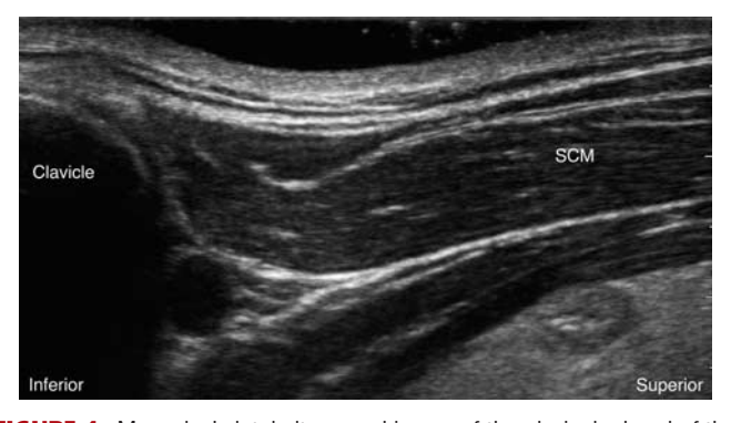
FIGURE 4. Musculoskeletal ultrasound image of the clavicular head of the sternocleidomastoid muscle in long axis, showing restoration of the normal pennate sonographic appearance of the muscle fibers, without evidence of significant scar-tissue formation.

Management of SCM injuries should proceed according to basic soft-tissue injury-care practices. Initial care should include thorough physical examination and advanced diagnostic imaging evaluations. Upon its diagnosis, aggressive physical therapy should be instituted to relieve pain and inflammation, followed by pain-free range of motion exercises, progressive strengthening, and functional progression to sport-specific exercises. When conservative treatment fails to alleviate symptoms, minimally invasive procedures such as PRP injection can be helpful.