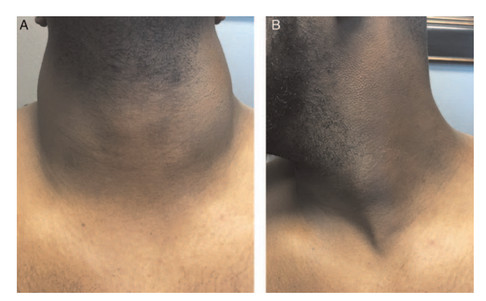
FIGURE 3. (A and B) Clinical photographs 14 mo after the procedure showing no evidence of deformity or torticollis.

of this anesthetic into surrounding nervous tissue, particularly the phrenic nerve. Phrenic nerve palsies are a known complication to interscalene blocks and may result in hemidiaphragm paresis, which may be discomforting and life-threatening for the patient undergoing the procedure.<sup>11</sup> Practitioners should be aware of the potential complications and consider the aforementioned treatment methodology for direction to assist them in performing this procedure in a safe and effective manner.